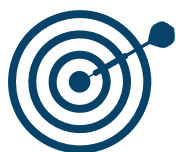
Focusing on your goals

Your approach to investment will vary depending on what you are looking to achieve.